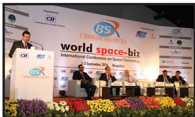
Opening Ceremony of World Space-biz - CII President addressing the gathering

There were seven interesting sessions held during the conference which focussed on topics like Turnkey Satellite System Realisation; Tapping New Market for Satellite Sub-Systems; Production of Launch Vehicle through Industry; Connecting the Unconnected: Unlocking potential through HTS; NAVIC and GAGAN : The Opportunities Ahead; GIS and Navigation Enabling and Trends; Space Start Ups: The New Face of Industry. In addition, there were highlight address and lightning talks on futuristic communications by eminent industry professionals.