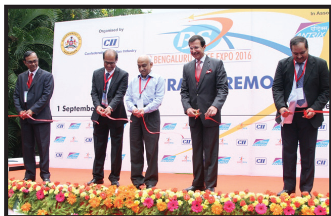
Inauguration of Space Exhibition

A trade exhibition alongside the expo had participation by various space Industries from India and abroad. More than 70 exhibitors had their stalls at BSX 2016 including ECIL, Centum, Ananth Technologies, Data Patterns, Astra Microwave Products, Viasat, CNES, Swissnex, Asiasat, Measat etc.