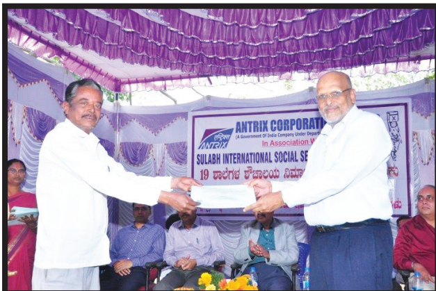
Handing over of assets to Government Schools under "Swachh Vidyalaya Abhiyan" program