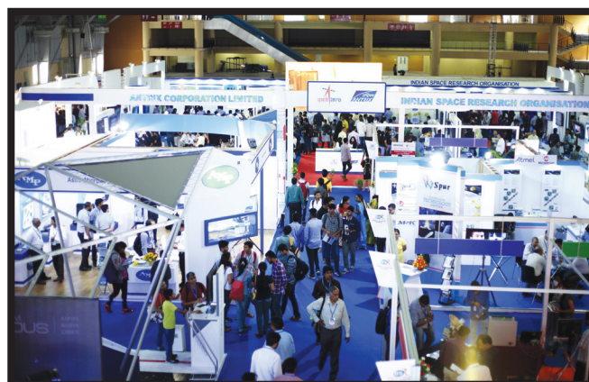
Industry Pavilions at BSX 2016

with INSAT/GSAT Users of space segment capacity had a combined participation of more than 200 delegates from industry.