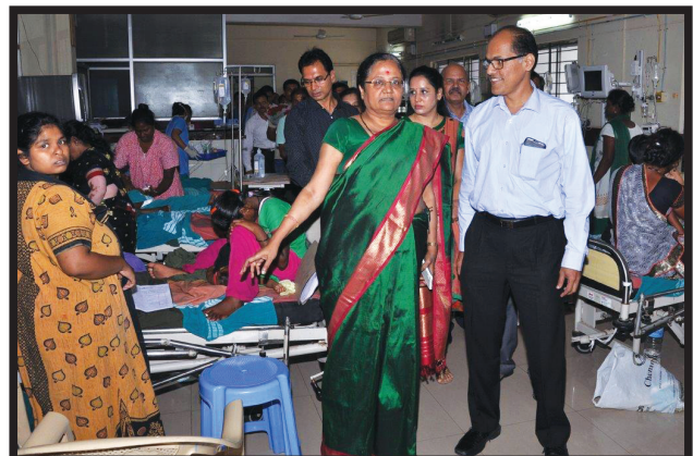
Visit to Indira Gandhi Institute of Child Health Hospital to implement CSR Activity